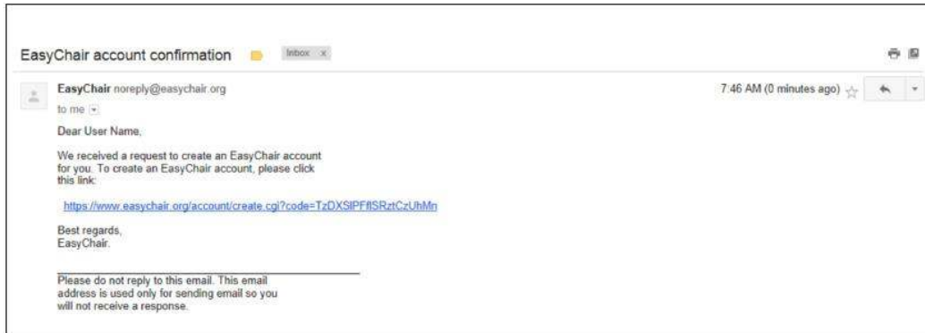
Figure 3: Login email

After registering, you will receive an email similar to the one in Figure 3. Use the link provided in the email to continue the account registration process.