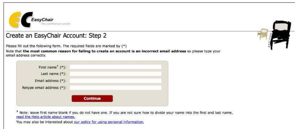
Figure 2: Fill in the form

Then, follow the on-screen instructions and complete the form (as shown in Figure 2), and click on “Continue.”