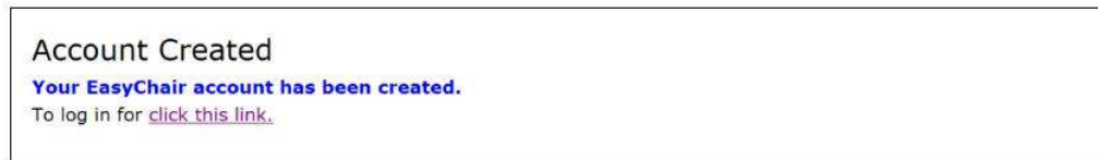
Figure 5: Link to the login page

After the account is registered, you may log in to ICDEMM 2021 simply by clicking on the “click this link” link (as shown in Figure 5), or on the following link https://easychair.org/conferences/?conf=icdemm2021 .